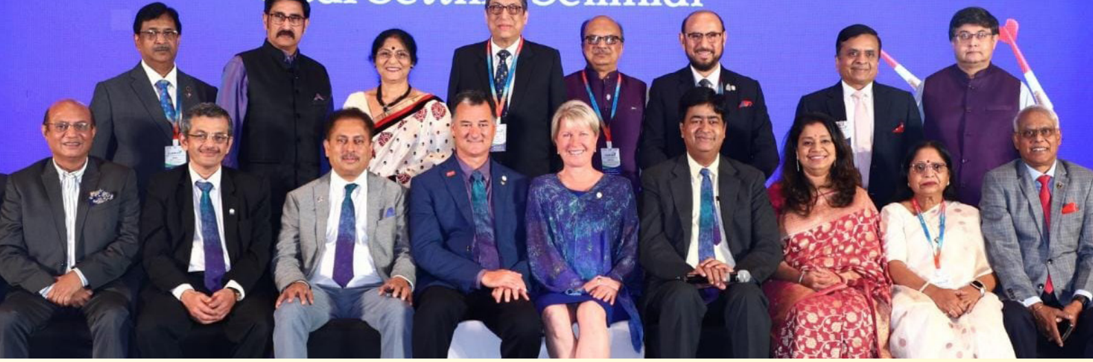
The official photograph in Pune of District 3291 officials with RI President & her Indian leaders.